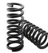
◆ COIL SPRINGS