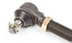
◆ TIE ROD ENDS