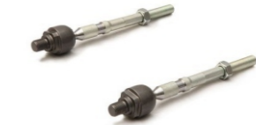
◆ RACK ENDS