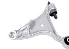
◆ CONTROL ARMS