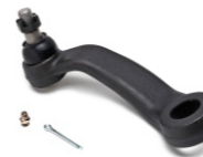
◆ PITMAN ARMS