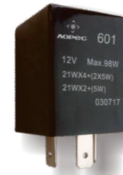
AUTOMOTIVE FLASHER 601