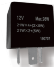
AUTOMOTIVE FLASHER 609