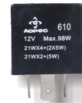
AUTOMOTIVE FLASHER 610