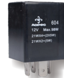
AUTOMOTIVE FLASHER 604